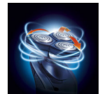
Flex & Pivot Action