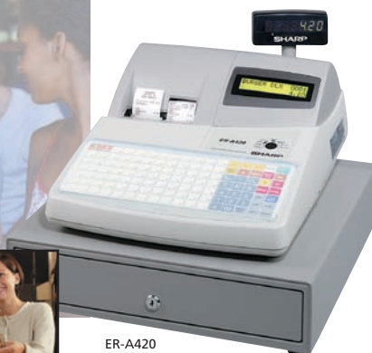
ER-A420 Flat Keyboard