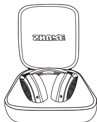
Zippered Hard Travel Case