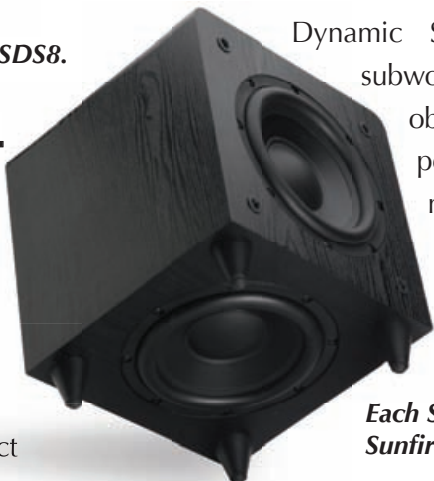
Each SDS Subwoofer features two, custom Sunfire drivers for the most bass in its class.

The latest expression of Sunfire's vision is called the Sunfire Dynamic Series. True to their name, these three all-new subwoofers are both vibrant and forceful, delivering Sunfire's acclaimed blend of powerful bass delivered with both high-resolution and high output. How much bass? Up to 600 Watts of dependable, cool-running Sunfire bass wrapped in the smallest cabinet of any product