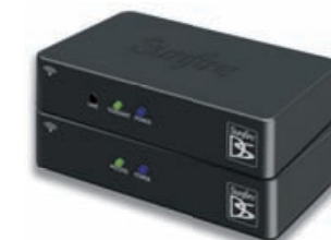
The SDS 2.4Ghz Wireless Transmitter (model WiTX) and Wireless Receiver (model RiTX). Experience no audio dropout up to 40 feet from the source.

Now you can place your SDS subwoofer wherever it will perform its best without the nightmare of drilling, snaking or dragging wires through your living area. Sunfire's 2.4Ghz wireless kit is specifically designed and tuned for subwoofer applications. All you need is a power outlet near the sub and you're ready for optimal plug-and-play bass with no visual noise attached.