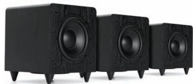
Sunfire's Dynamic Series includes the SDS12, SDS10 and ultra-compact SDS8.