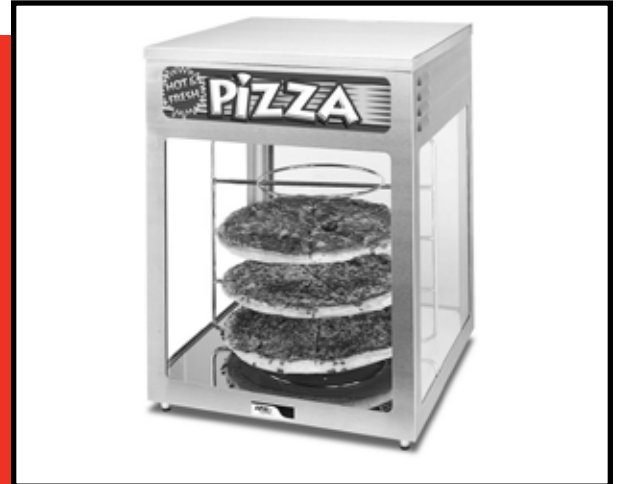
HDC-4 Heated Display Cabinet