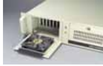
Figure 2-2: Cooling fan & filter

Refer Figure 2.2 to find location of system cooling fan and filter. Please replace system cooling fan if it is defective; replace or clearing filter when the dust is too heavy.