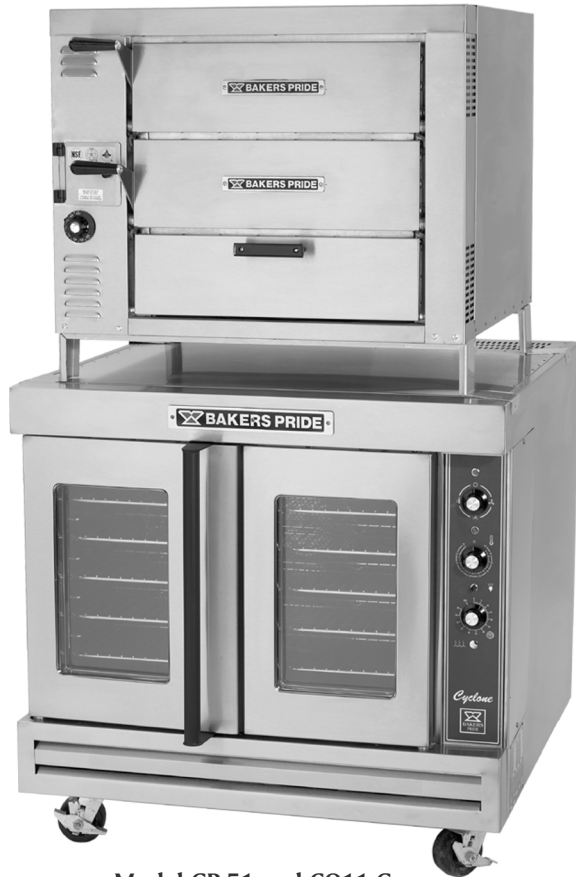
Model GP-51 and CO11-G with optional casters