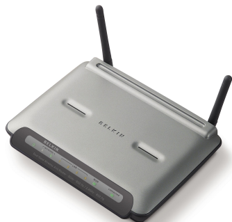
Dual-Band Wireless A+G Router (F6D3230-4)