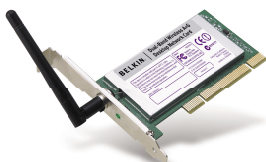
Dual-Band Wireless A+G Desktop Network Card (F6D3000)