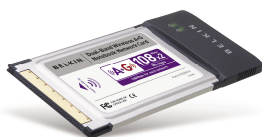
Dual-Band Wireless A+G Notebook Network Card (F6D3010)