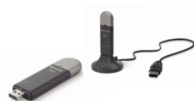
Dual-Band Wireless A+G USB Network Adapter* (F6D3050)