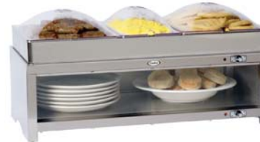
Model CMLB-CSLP Warming Cabinet with Mid-Size Buffet Server (plates not included)