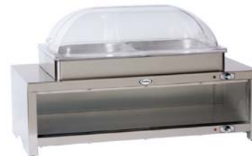
Model CMLB-C2RT Warming Cabinet with Buffet Server with Low Profile Roll-top Lid