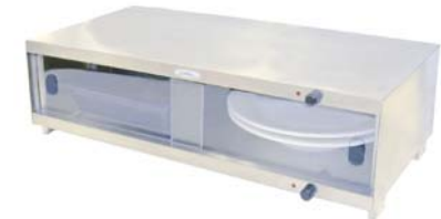
Model CMLW-C Warming Cabinet with Mid-Size Warming Tray (plates not included)