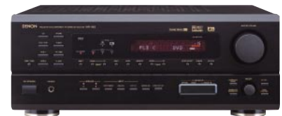
Front panel with terminal cover.

*Design and specifications are subject to change without notice.