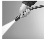
Press Lever To Discharge Powder