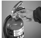
Break Seal and Pull Out The Safety Pin

This unit will not operate with mounting bracket attached. The extinguisher must be removed from the mounting bracket or it cannot discharge its contents to fight a fire.