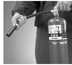
Aim Nozzle at Base of Fire