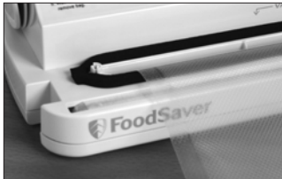
Place Bag in Vacuum Channel