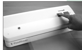
Press and Release On/Cancel Button