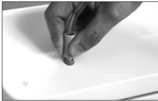
Insert Accessory Hose