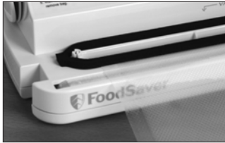
Place Bag on Sealing Strip