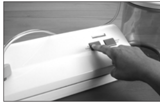
Press and Release On/Cancel Button