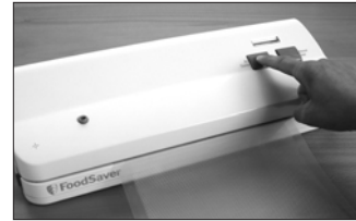
Press and Release On/Cancel Button