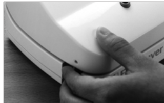
Lock Lid by Pulling Side Locks