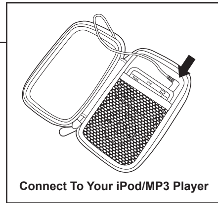
Connect To Your iPod/MP3 Player