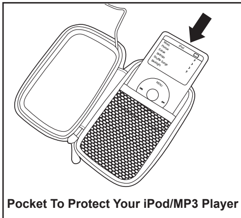
Pocket To Protect Your iPod/MP3 Player